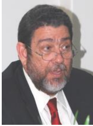
St Vincent and the Grenadines Prime Minister Dr Ralph Gonsalves

The two leaders feel such a policy will undermine the region's integration drive, the CARICOM Single Market and Economy (CSME).