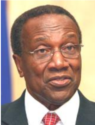
Edwin Carrington, CARICOM Secretary General

GEORGETOWN, Guyana (GINA) -- CARICOM Secretary General, Dr Edwin Carrington, revealed, on June 12 at an interactive media session at the Secretariat building, Turkeyen, that the Community is working on establishing a joint mission in an Eastern European state, although he did not reveal the country's name.