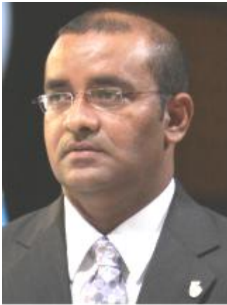
Guyana President, Bharrat Jagdeo.

GEORGETOWN, Guyana -- While Barbados' new immigration policy was not on the agenda of the Caribbean Community (CARICOM) heads of government conference in Trinidad and Tobago on Sunday, Guyana's President Bharrat Jagdeo and St Vincent and the Grenadines Prime Minister Ralph Gonsalves used the occasion to air their concerns regarding the move by the David Thompson administration to toughen its immigration policy regarding non-nationals.