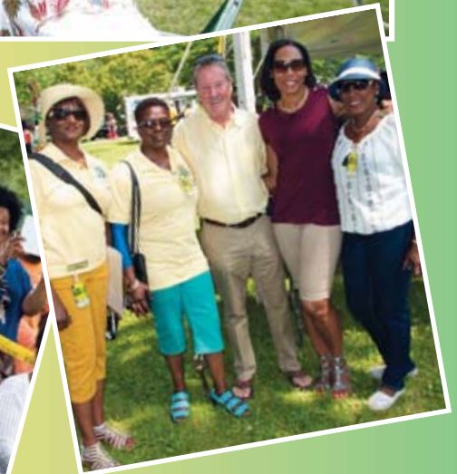
All Photography of the Unity Picnic by Jack Dear, Montreal