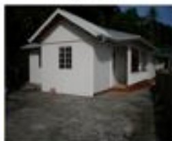
House &amp; Apt Complex, Biabou