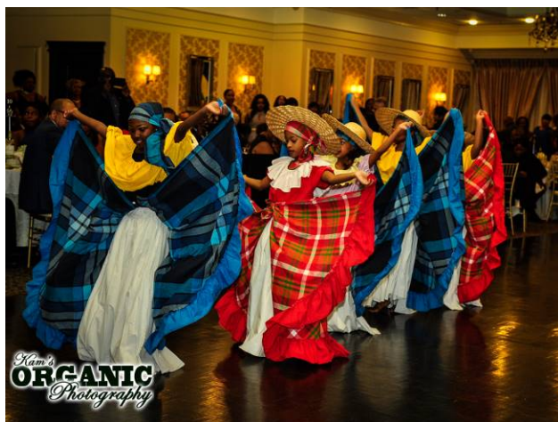
Young Entertainers at Independence Gala