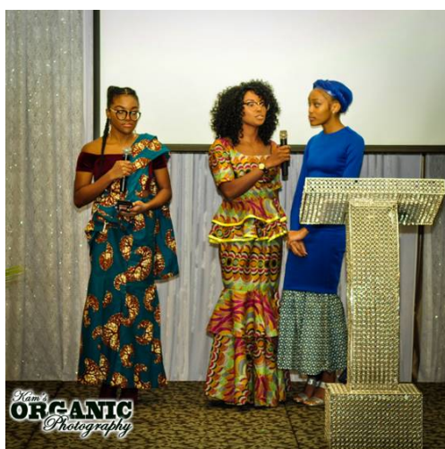
The Hutchinson Sisters at Independence Gala