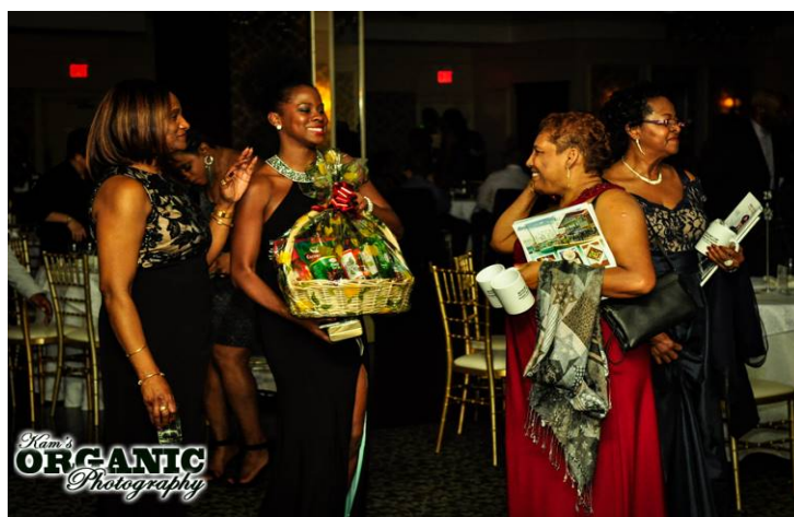
Gift Basket Winner