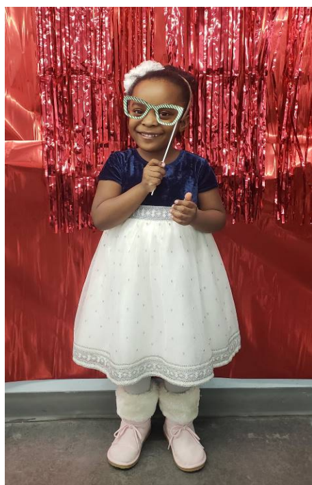
Little Princess Picture Ready at Christmas Party