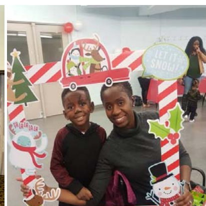
Children at Christmas Party