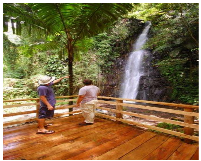
Dark View Falls

Last year, the multimillion dollar Buccament Bay Resort was opened on St. Vincent complete with a Pat Cash Tennis Academy, a Liverpool Football Club Soccer School, a Harlequin Performing Arts Academy and Spa treatments by ESPA. Currently housing 90 villas with 1, 2 and 4 bedrooms each, a full complement of 1,000 rooms should be ready to coincide with the opening of Argyle International Airport.