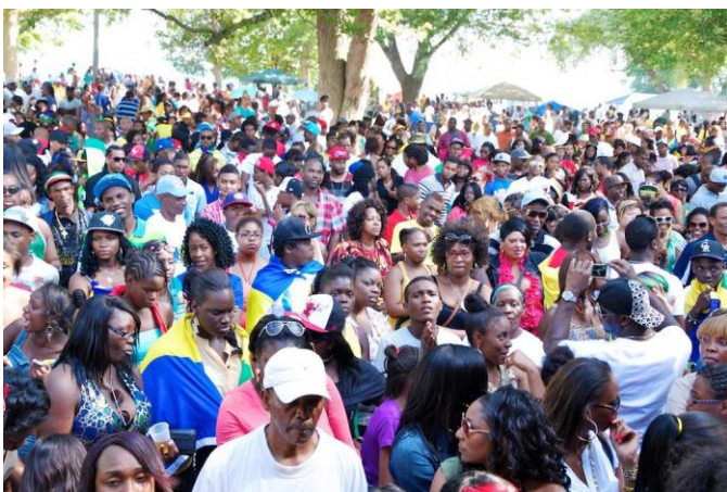
Section of the thousands that gather each year