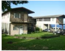
H702 Cane Garden Property on 20,000 sq.ft Open to offers