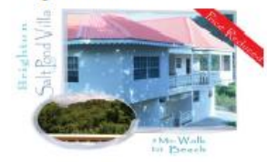
H901 Salt Pond Villa Prospect . 10,005 sq.ft Land 4 bed / 3 bath. EC$645,000.00