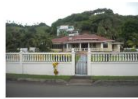
H713 Georgetown, 3 bed 2 bath, 23,422 sq.ft. ECD$700,000.00