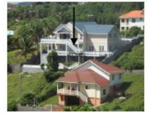
H864 Rawacou House Nr Argyle Built to European Standard EC $1.2m