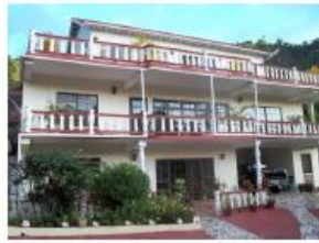
H496 Oriental Jade Layout 5 bed / 4 bath EC $935,000.00