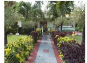
H980 Cock Robin's Bungalow Belvedere. Pkg deal incl 2 Fur- nished Houses Plus 2 cars and boat