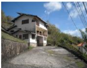
H509 Fountain Villa, 32,508 sq.ft ECD$850,000.00