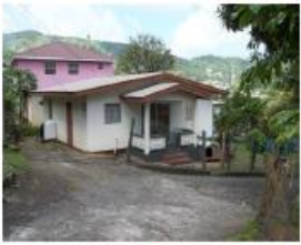
H350 Primus House New Montrose 3 bed / 2 bath EC $275,000.00