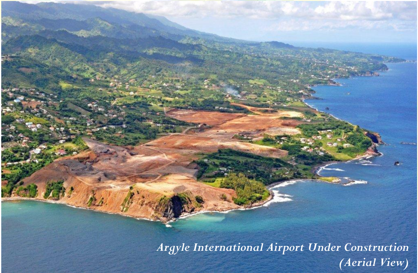
Argyle International Airport Under Construction (Aerial View)

Honouring our Past • Celebrating our Present • Building our Future