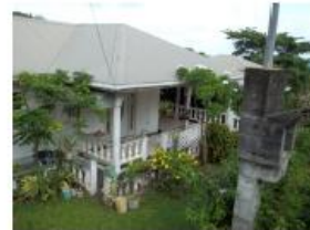
H870 Stubbs House Land 6,658 sq.ft 6 bed / 3 bath EC$440,000.00