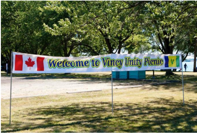
This greeting says it all

One of the largest gatherings of SVG nationals outside of SVG