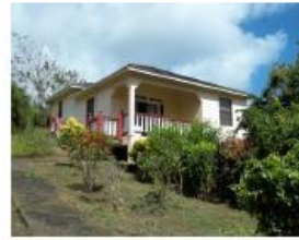
H910 Sandra's Cottage Biabou Land 26,630 sq.ft EC$250,000.00