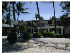
CC070 Villa Casurina, Palm Is- land, 21,000 sq.ft. 7 bed 5 bath ECD$1,350,000.00, (Leasehold)