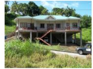
H600 Theo's Villa, Cedars 3 bed 2 bath, 6,395 sq.ft 2 bath, 6,395 sq.ft. ECD $428,958.50