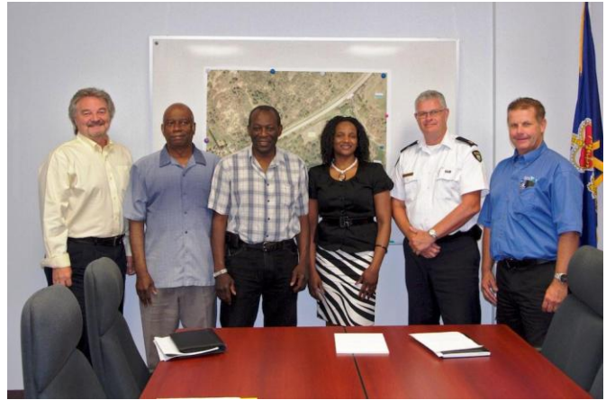
Unity Picnic Committee & Park Representatives