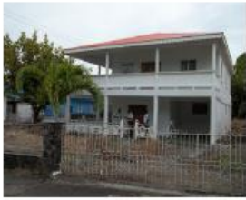
H807 White Swan Indian Bay 4 bed/ 3 bath EC$625,000.00