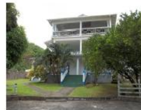
H874 Egret Apartment Hotel. Brighton 47,000 sq.ft. 14 bed / 10 bath Open to offers