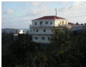
H503 Cedars, 3 bed 3 bath, 4,649 sq.ft. ECD$690,000.00