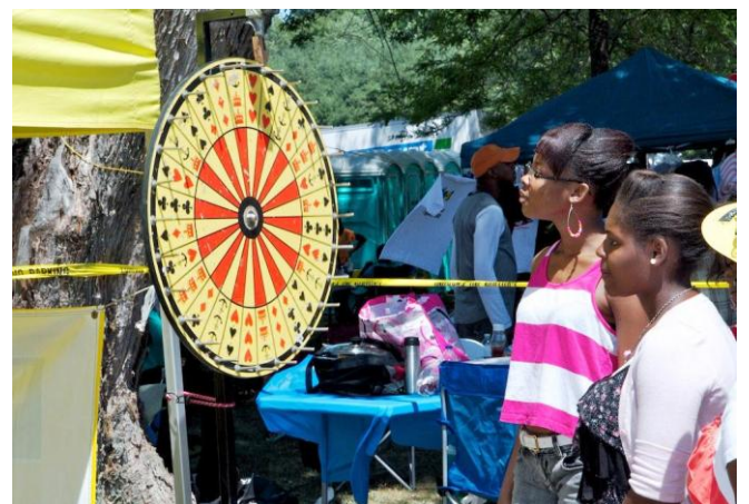
Is The Price Right?