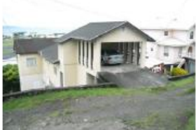
H395 Amos Vale , 6 bed 4 bath, 9,470sq.ft, ECD$800,000.00