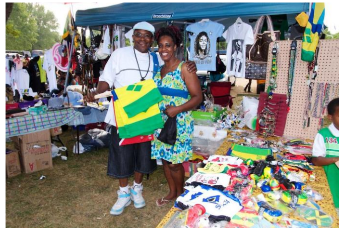
One of the many vendors