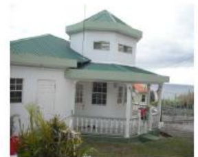
H515 Ole George Mansion Bonadie Hill 5 bed / 4 bath Open to offers