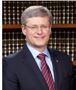
Hon. Stephen Harper

I am pleased to extend my warmest greetings to the members of the St. Vincent and the Grenadines Association of Toronto Inc. on the occasion of the 33rd anniversary of the independence of St. Vincent and the Grenadines.