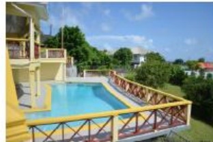
H882 Queens Drive 3 bed 3 bath ECD$1.7M