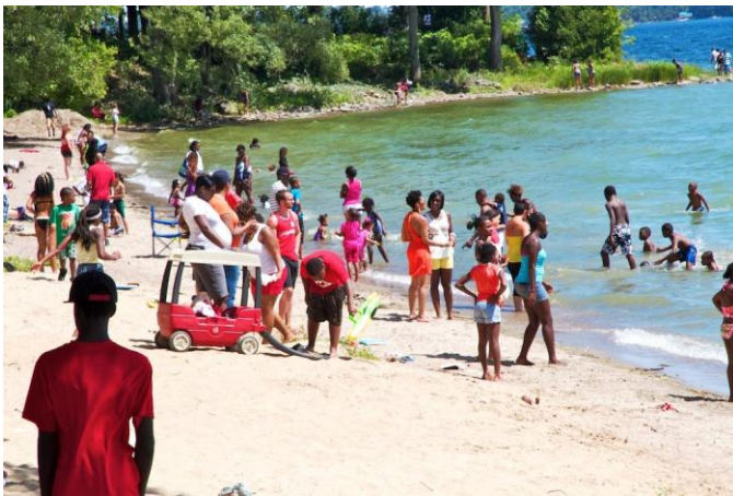
What is a picnic without a beach?