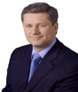
Hon. Stephen Harper

It gives me great pleasure to extend my warmest greetings to everyone marking the 28 th anniversary of the independence of St. Vincent and the Grenadines.