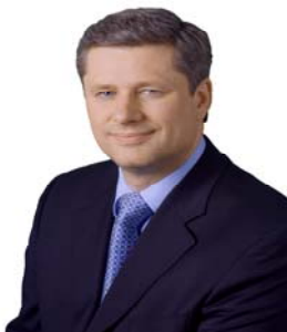
Hon. Stephen Harper

It is with great pleasure that I extend my warmest greetings to everyone marking the 27 th anniversary of the independence of St. Vincent and the Grenadines.