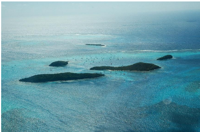
Aerial view courtesy of Iain Grant

The Tobago Cays Marine Park (TCMP), located in St. Vincent and the Grenadines, houses a series of globally significant habitats including coral reefs, sea turtle nesting sites and feeding areas, and small systems of mangroves. The marine portion of the park surrounds five uninhabited cays, the populated island of Mayreau, and three islets. The four-kilometer-long Horseshoe Reef, the longest of the four main reef systems in the TCMP, encloses four of the cays (Petit Bateau, Petit Rameau, Baradal, and Jamesby) with the fifth cay (Petit Tabac) lying just outside the reef to the east.